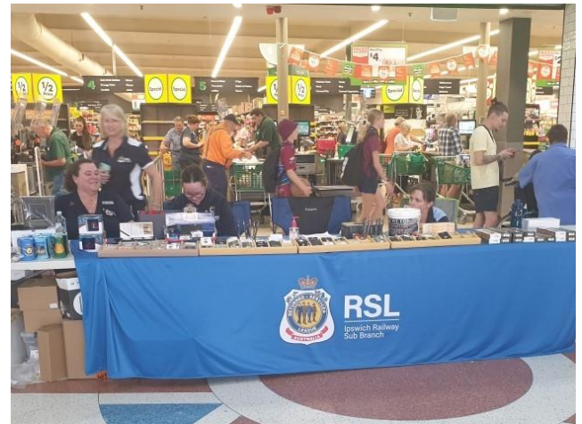
Our volunteer badge sellers at Brassall shopping center.

but due to several reasons she cannot stay there much longer. Please feel free to support this important piece of Queensland history. To sign the petition go to https://chnq.it/Fj5D9jBzVQ