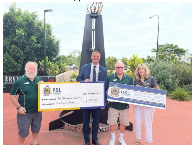
Cheque presentation at Ripley

One of our budget items for this year was for commemorations and this year we and Ipswich jointly made a donation to the Ripley Valley College for the construction of a school memorial, pictured below.