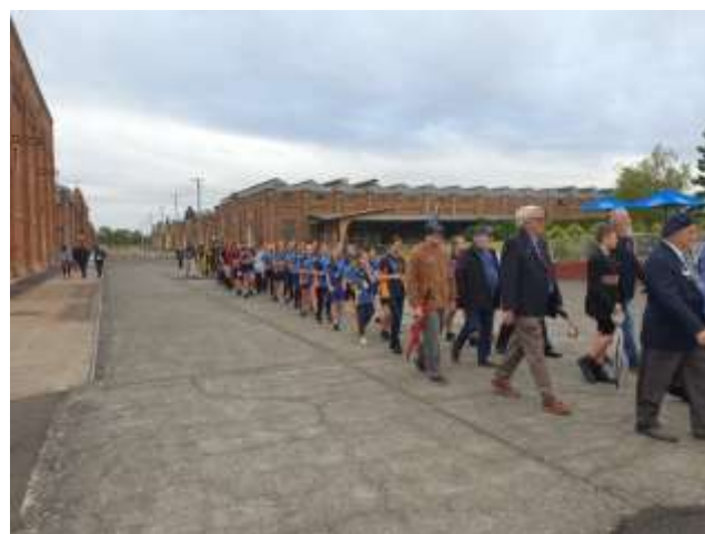
Marching on at the Workshops

And on the 25th. Well, what a great day we had on Anzac Day. The good Lord held off with the heavy rain for the sub branch's Anzac Day service. The rain did not deter the commitment by all to honour this sacred day. Our hosts at the Workshops Museum advised that we had approximately 1500 attend the service.